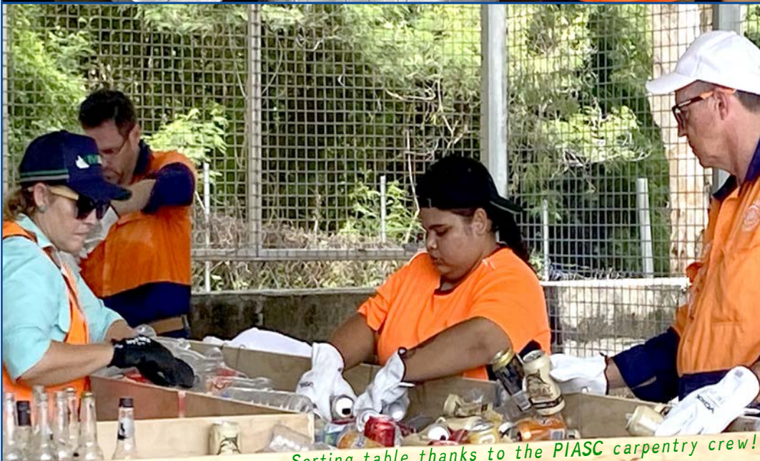
Sorting table thanks to the PIASC carpentry crew!